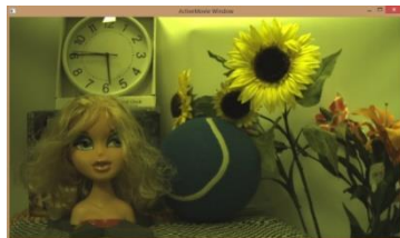
Camera Tool view mode