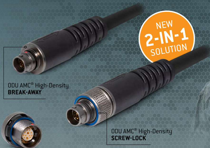
ODU AMC ® High-Density BREAK-AWAY

The new flexible 2-in-1 solution, of the ODU AMC ® High-Density series offers on the one hand the possibility of fast locking and unlocking of the connection and on the other hand additional protection through screw locking in case of high resistance to vibration whenever this is necessary.